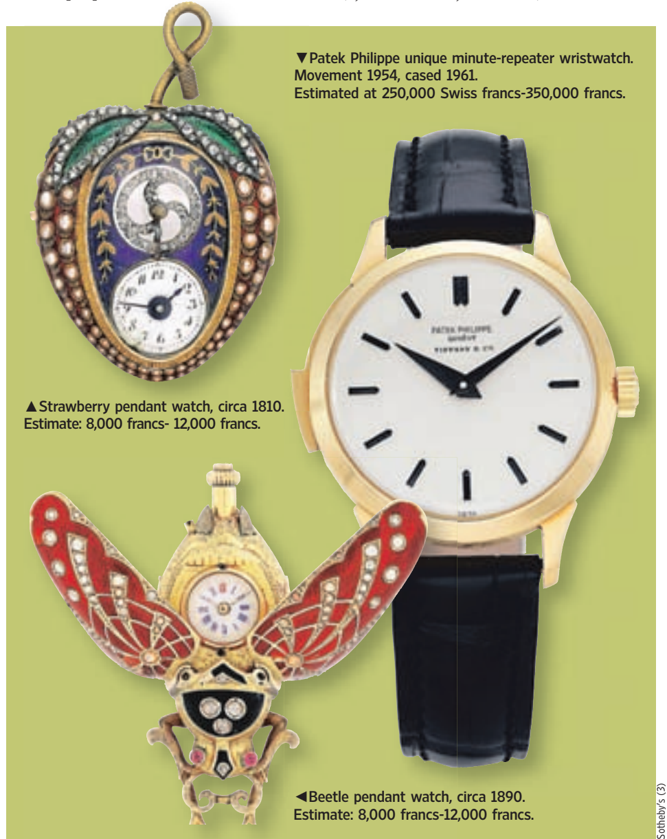
▼ Patek Philippe unique minute-repeater wristwatch. Movement 1954, cased 1961. Estimated at 250,000 Swiss francs-350,000 francs.

See more of George Daniels's handcrafted watches, at WSJ.com/lifeandstyle .