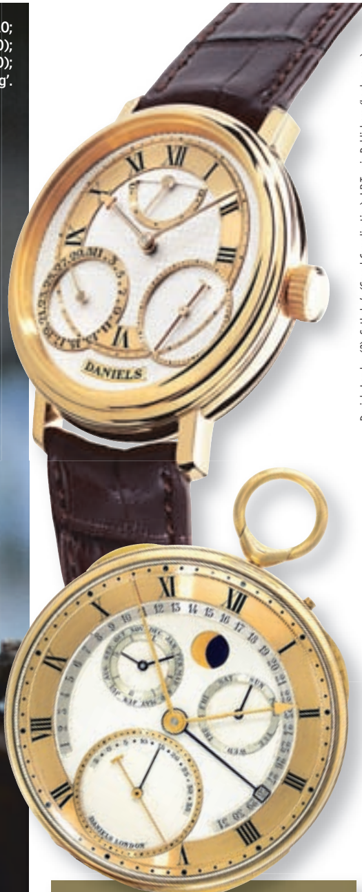
Daniels London (2); Sotheby's (Grand Complication); I.B.Tauris Publishers (book cover)