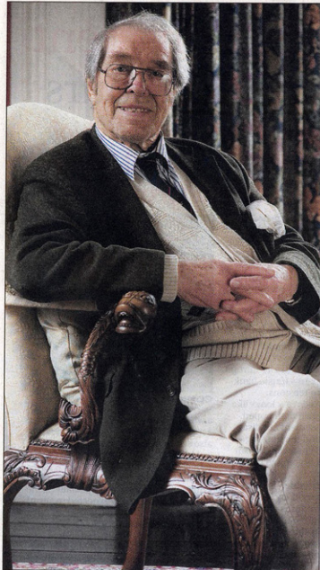
GEORGE DANIELS: Shortly before his death he approved the design for the series of watches bearing his name being developed by Roger Smith

Roger said George Daniels was always keen to promote the island as a 'centre of excellence' for horology and he is happy to continue that for years to come.