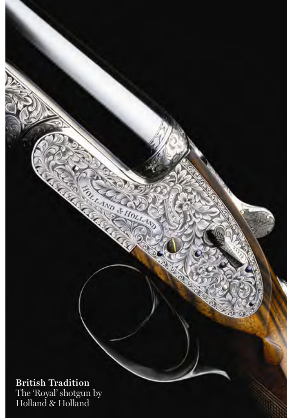
British Tradition The 'Royal' shotgun by Holland & Holland

A further demonstration of how highly regarded British craftsmanship has become is apparent at the annual, major classic-car events, Concours d'Elegance, in America