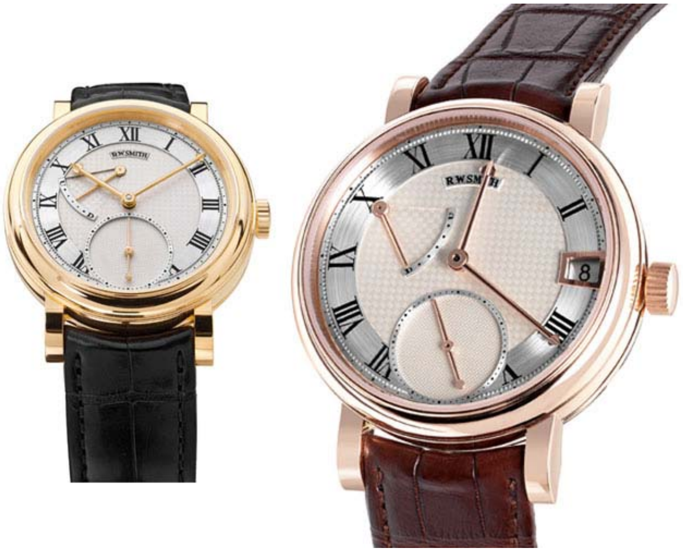
Left: The SERIES 2 WATCH - Right: Unique Commission No.4, by Roger W. Smith

About the Unique Commission No. 4: A one minute tourbillon wrist watch fitted with the Daniels co-axial escapement and a unique date complication. Cased in 18 carat red gold.